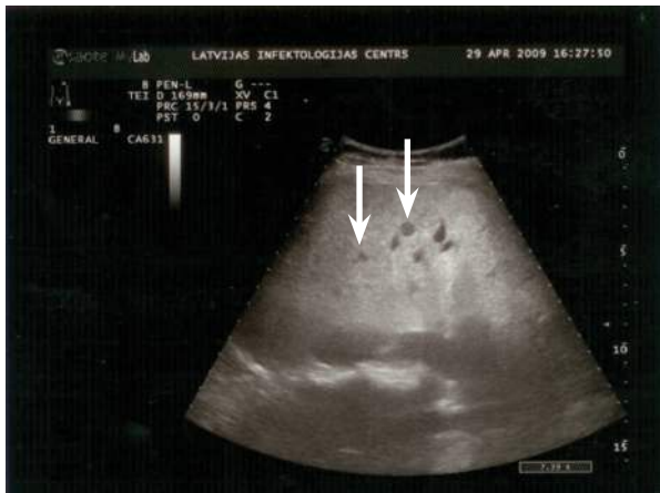
Fig. 1. Right lobe of the liver with hypoechogenic foci, ultrasound.